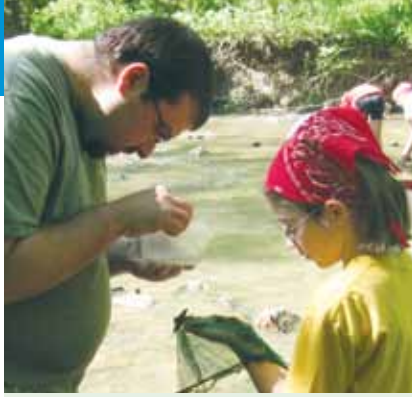
Outdoor Education students see God's creation up close.